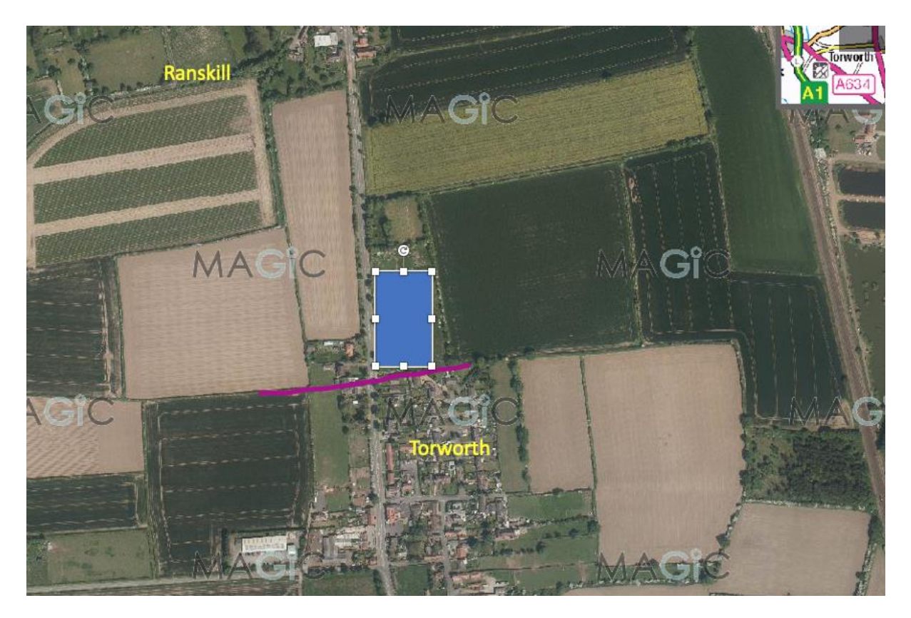
At the point of determining the planning application The Draft Local plan (Jan 2020) policy ST2 stated that planning applications which resulted in coalescence would not be supported.

Picture C, shows a purple line boundary between the 2 villages and the siting of the new development in blue: